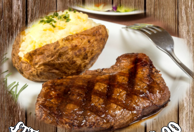
STEAK DINNER $14.00

ORDERS MUST BE CALLED IN BY WEDNESDAY 650-355-1540 PICK UP FROM 5:30PM TO 7PM