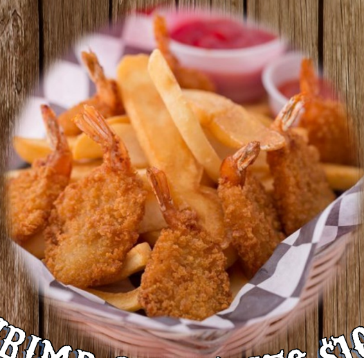
SHRIMP AND FRIES $10.00