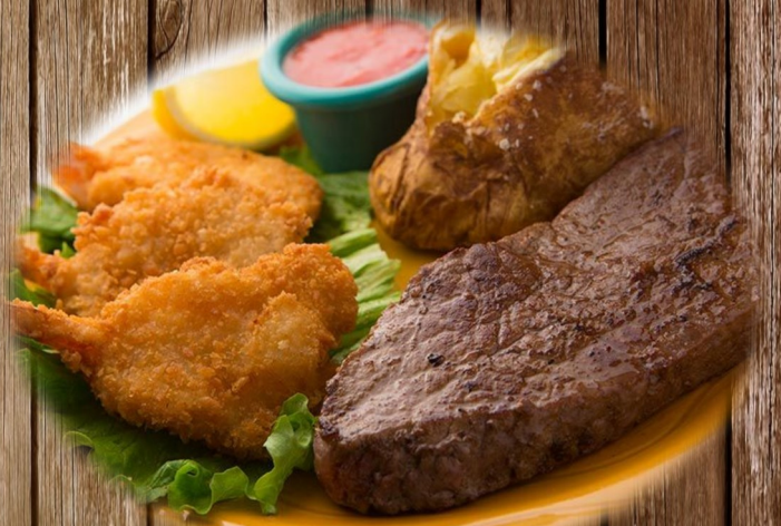
SURF & TURF INCLUDES 4 PRAWNS $17.00