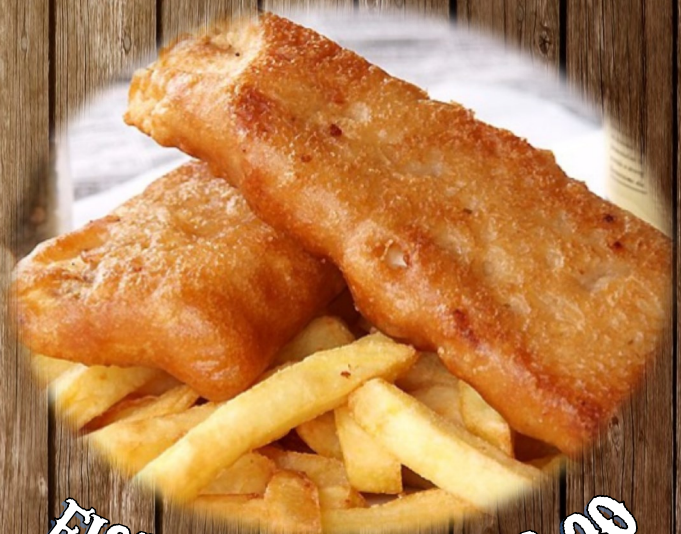
FISH & CHIPS $10.00

Effective January 1st our dinner prices will be increased